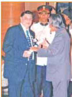
In 2005 receiving the "Padma Shree" India's fourth highest civilian honours from then Hon'ble President of India, Dr. A. P. J. Abdul Kalam.