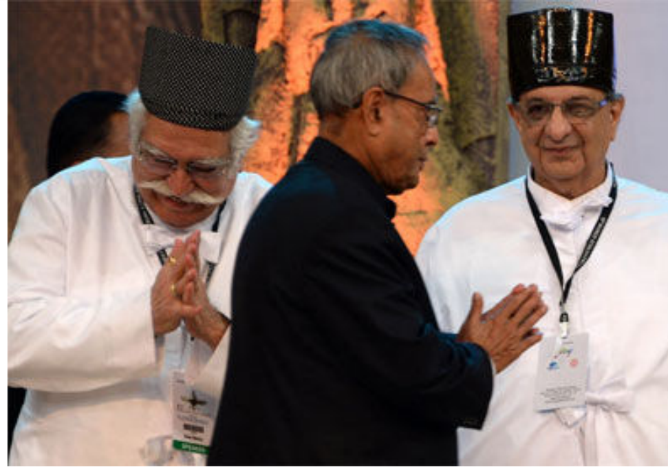
President of India, Hon. Pranab Mukherjee is seen greeting Dr. Cyrus Poonawalla, Chairman, 10th World Congress in Mumbai on Friday, 27th December 2013.